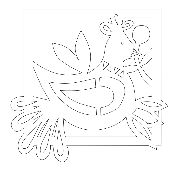
shown at 50%