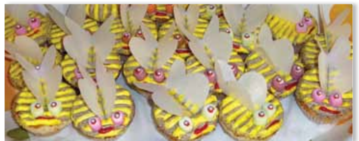
Honey cakes for Bee Aware Week

Members from around the country held Bee Aware days in their local communities to raise awareness about the plight of the honey bee. Members challenged themselves to eat food exclusively pollinated by bees for one day.