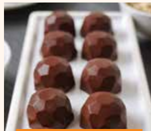
Platinum Special: Botanical Chocolates