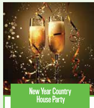
New Year Country House Party

189.500 – 30 December 2018 – 2 January 2019