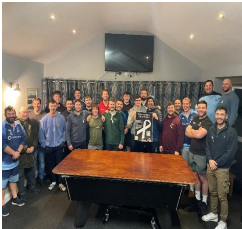
Narberth Rugby Club

Pembrokeshire Federation has established links with, and secured the support of, Narberth Rugby Club, Fishguard and Goodwick Rugby Club and Ludchurch Men's Shed.