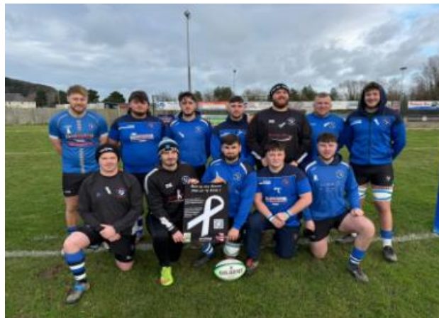
Fishguard & Goodwick Rugby Team

Powys Brecknock Federation has recruited the support of a number of choirs, including Brecon & District Male Choir and Côr Meibion Talgarth, who have worn white ribbons during their performances. The Federation has also gained the support of Penlan Bowls and Brecon Town Council.