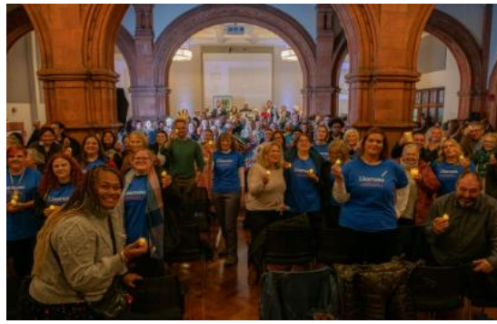
Candlelight vigils at the Senedd