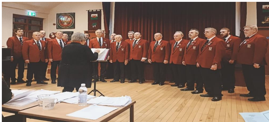
Brecon & District Male Choir

Powys Brecknock Federation has recruited the support of a number of choirs, including Brecon & District Male Choir and Côr Meibion Talgarth, who have worn white ribbons during their performances. The Federation has also gained the support of Penlan Bowls and Brecon Town Council.