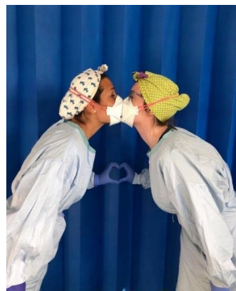
Photo above shows the doctors actually wearing the scrubs