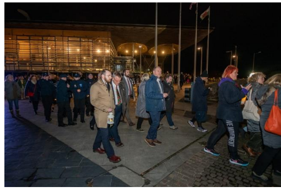
2023 Candlelight Vigil