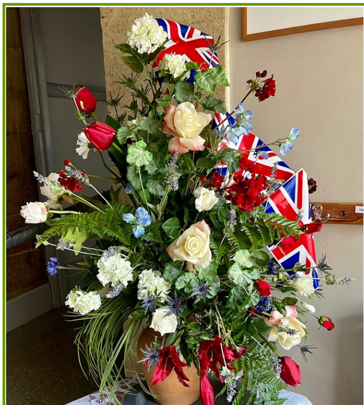
Geddington and Newton WI's Jubilee arrangement (see page 10)