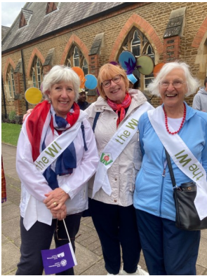
NCFWI was represented in the Northamptonshire Jubilee Pageant

This historic occasion was celebrated by WIs across the county with a dress code of red white and blue, plus tiaras!