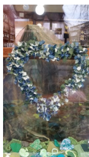
June Turner 'showing the love' in her shop window.