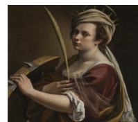
Artemisia Gentileschi, Self Portrait as Saint Catherine of Alexandria, about 1615-17.