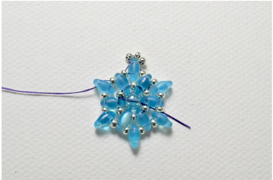
Repeat this step 5 times then pass through the first 2 of the last 3 seed beads added at the tip of a SuperDuo.