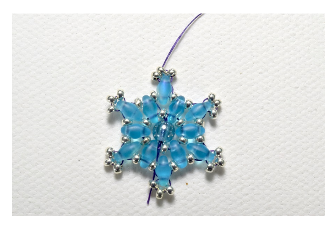
String 4 seed beads and pass through the middle seed bead on the tip again to form the loop for the earwire.