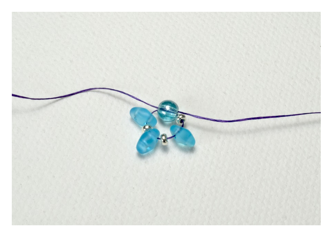
String 1 SuperDuo and 1 seed bead 3 times and pass through the 4mm bead again.