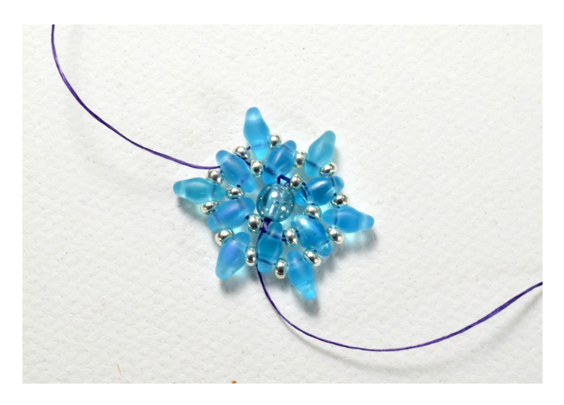
Pass through the next seed bead and the second hole of the next SuperDuo.