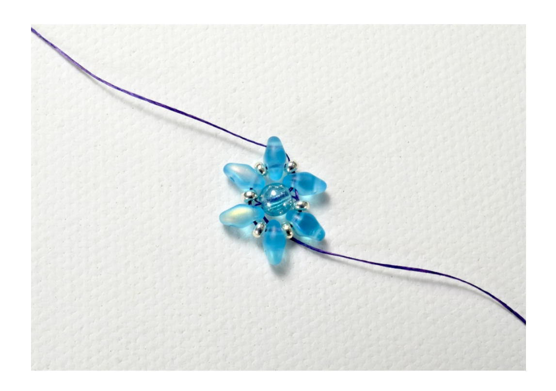
String 1 seed bead, 1 SuperDuo and 1 seed bead and pass through the second hole of the next SuperDuo. Repeat 5 times.