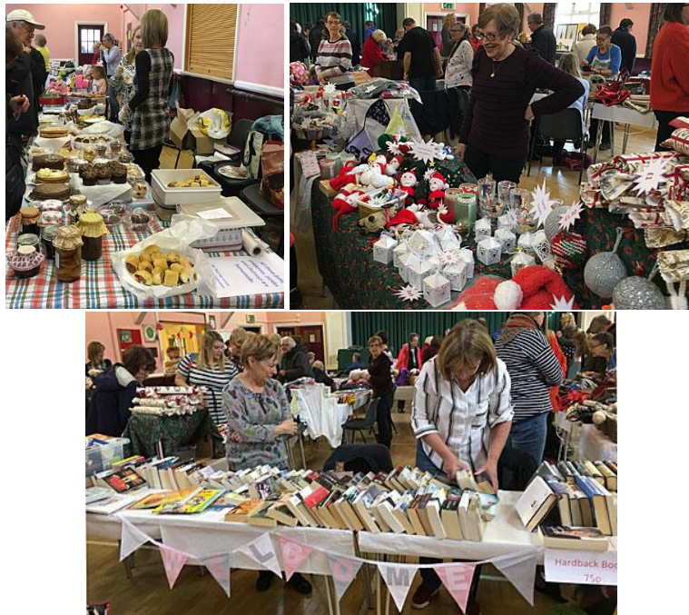
Autumn Fair – 21 st October

We had tombola, raffle and lucky dip, stalls that sold homemade cakes, savouries, pastries, jams, pickles and chutneys, books, toys, games, bric-a-brac, handbags, children's clothes, build-a-bear, bird and bat boxes, handmade crafts, Christmas novelties, plants, handmade cards and unique handmade crochet, knitting and sewing goods.