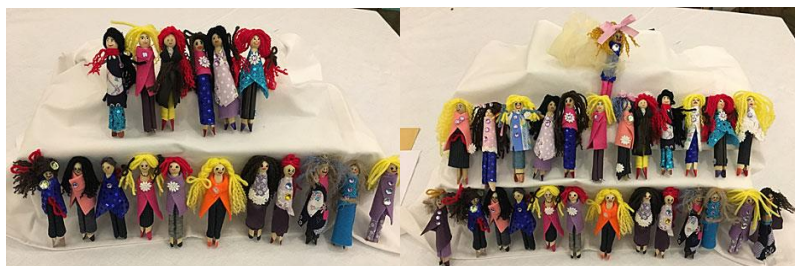
In October our members had fun making dolly pegs with Hilary