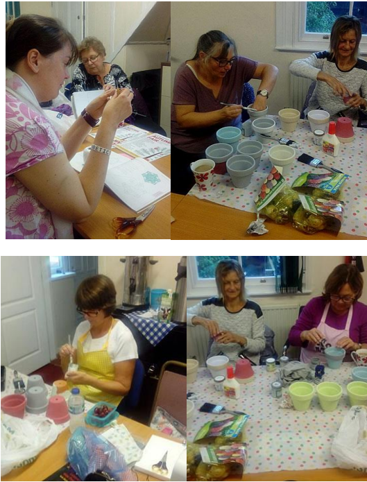
Our new Craft Club venue at the Old Reading Rooms is proving popular and the Autumn Fair kept our members very busy.