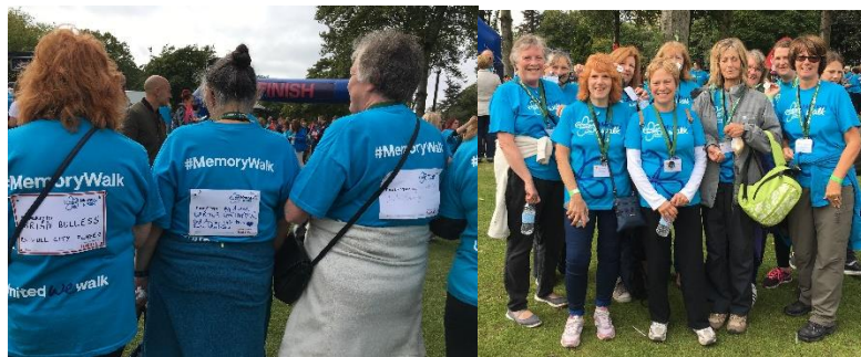
On 10 th September ten of our members took part in the Hull Memory Walk to raise awareness of dementia