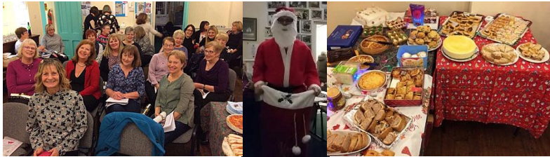
In December we had our Christmas Party with plenty of food, Santa and the Sweet Street Band