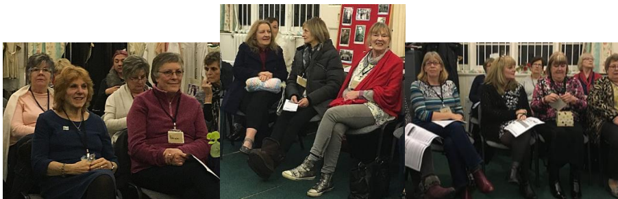
A Well Attended Annual General Meeting – 1 st February