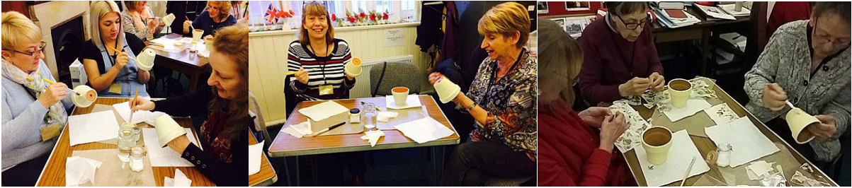
Plant Pot Decoupage – 5 th April