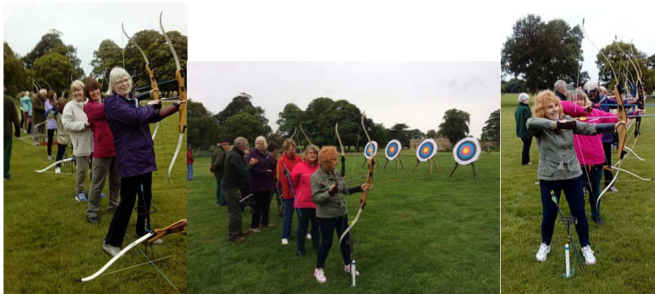
Some members tried their hand at Archery at Bishop Burton on a chilly June evening