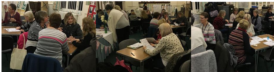
In March we had a lot of fun with a Beetle Drive