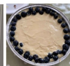
Blueberry and Lemon Cheesecake