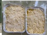
Herby Pork and Pear Crumble