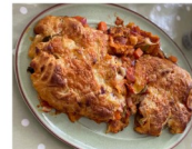
Roasted Vegetable Plait