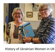
History of Ukrainian Women in UK