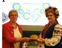
Traditional Welcome with Bread and Salt