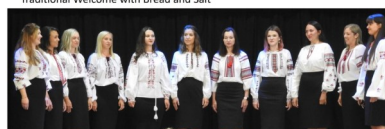
Choir showing different regional variations on Vyshyvanka (blouses)