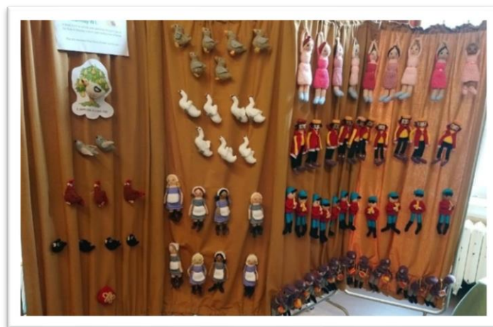
Twelve days of Christmas, Walmley Evening WI

Congratulations go to Hockley Heath and Allesley WI’s for winning the trophies.