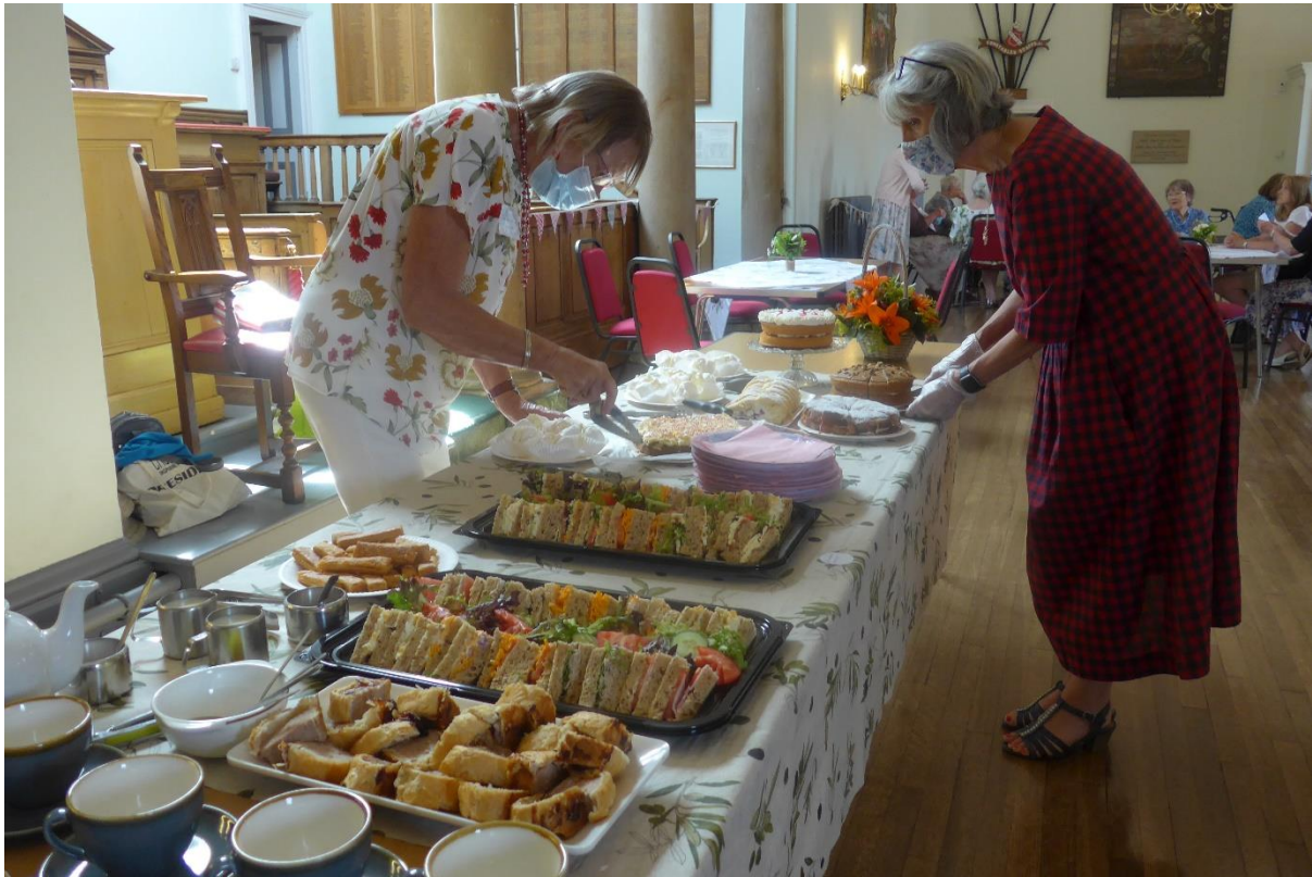
After some brief items of business a delicious buffet was prepared and served by Committee members wearing protective face coverings.