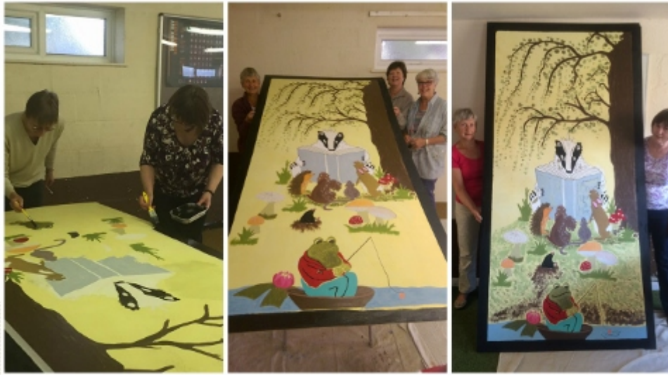
Days 2, 3 & 4