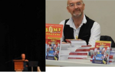
A Few Pictures from Spring Council