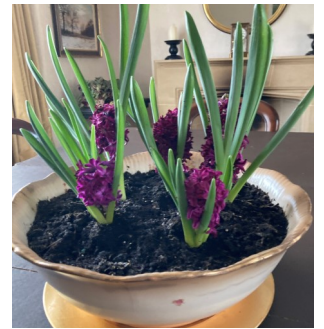
Gorgeous hyacinths grown from bulbs from last year's catalogue.

The new bulb catalogues are with you this month – your secretary has a digital copy which she can email to you, or there are some hardcopies for you to peruse. Remember - all orders to your secretary please, with the money - she will then compile one order form from your WI to send to us at WI House along with the money. Delivery of the bulbs to your secretary is late September. Please do support this fund-raising opportunity for the Federation, as we receive back from the Bulb company, 20% of the invoice price for our own funds.