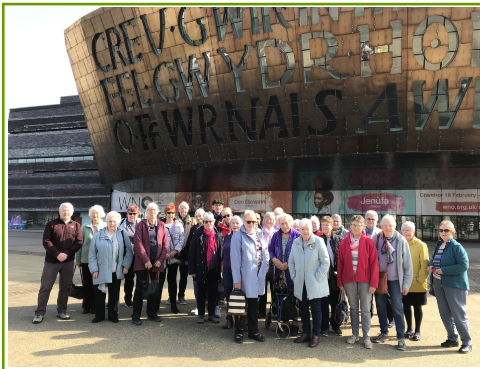
NCFWI Holiday to Cardiff