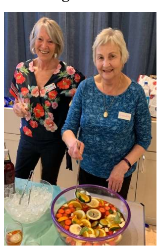
Serving the Pimms!