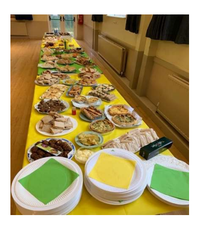
Our wonderful buffet