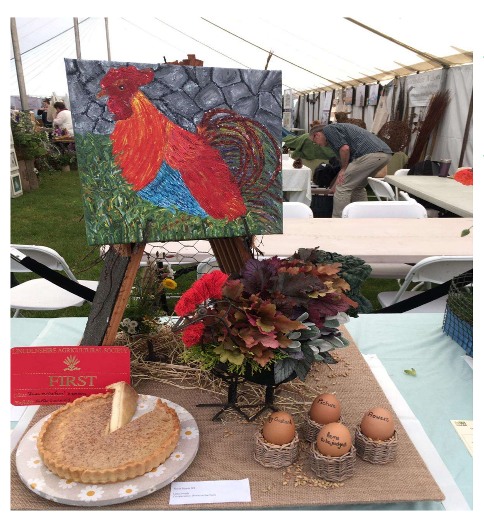
First in the Cooperative Class – North Scarle WI (Lincs North)