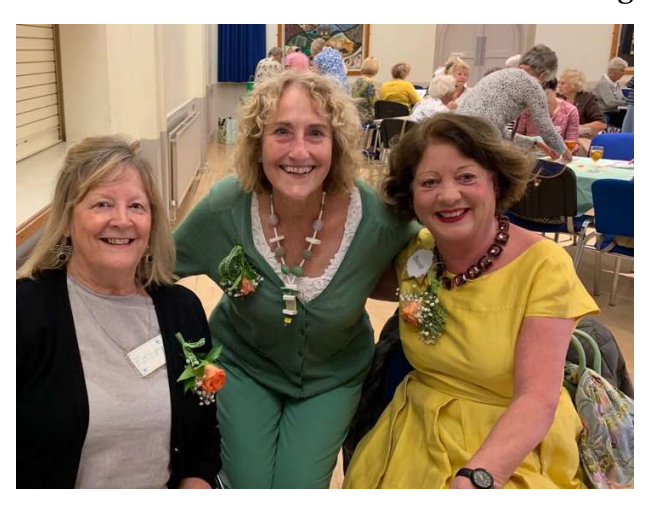
Members of the Committee with their corsages