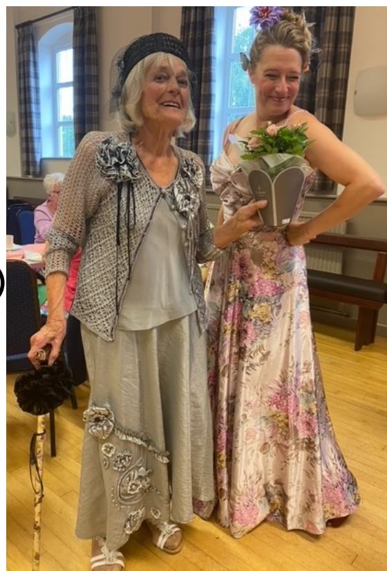
Glamorous costumes at the Silk and Roses talk