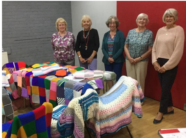
project Linus blankets

The clouds were heavy, rain was threatening, but we were not deterred. The heavens did not open and we spent two enjoyable hours catching up with old friends and sharing news.