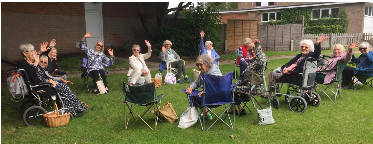
Photo above shows ladies enjoying a picnic in the park