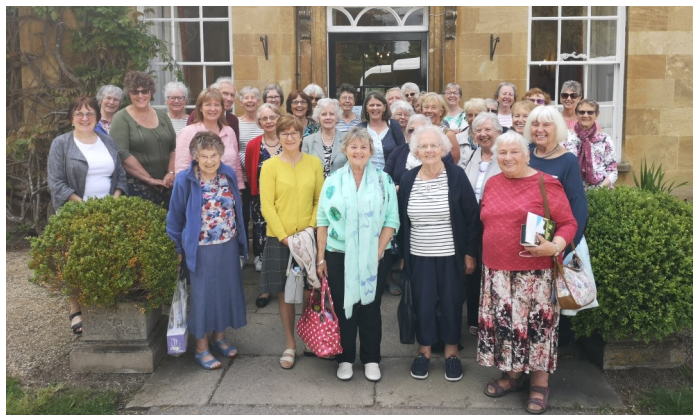
Suffolk West Members enjoying a comfort at Denman after the 2019 Annual Meeting.