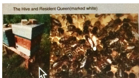
The Hive and Resident Queen (marked white)

Warkton Village WI has, for several years, sponsored a local beehive as part of their climate awareness and has raised money selling bee bags and holding a raffle.