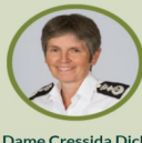
Dame Cressida Dick DBE QPM Commissioner of Police of the Metropolis